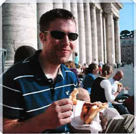
Enjoying lunch at the Vatican