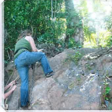
Hiking up a waterfall