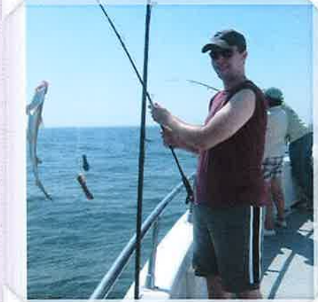
Fishing with the Family