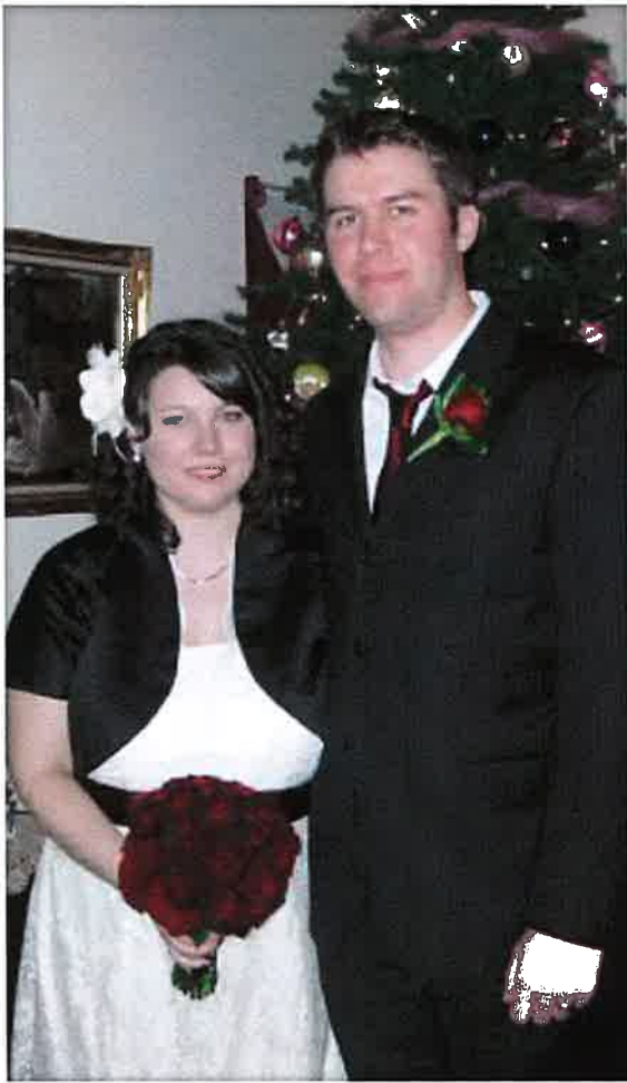
Our Church Marriage Blessing