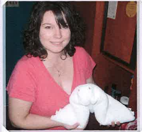
Getting a kick out of towel animals