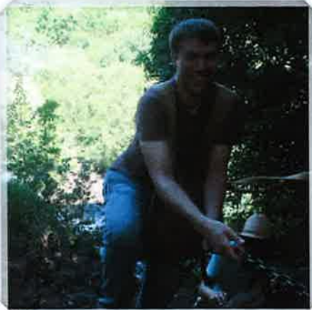
Hiking up a waterfall in Hawaii