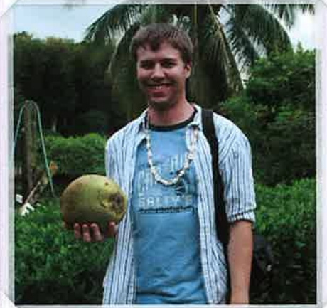
At a luau in Hawaii