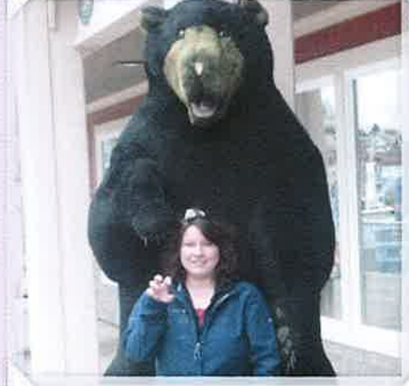
Grrr! Playing around in Alaska