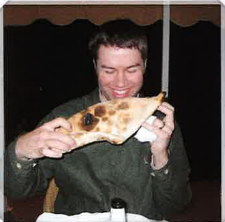
Loving the food in Italy!