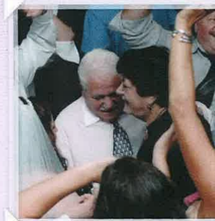
Dancing with grandparents at wedding