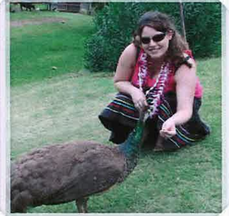
Feeding the animals at a luau