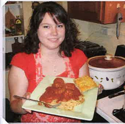
She loves to cook & is fantastic at it!