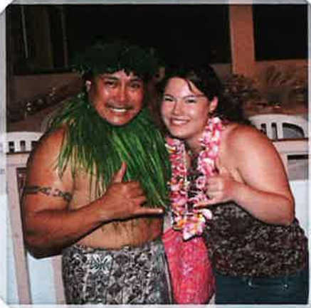
Hanging in Hawaii