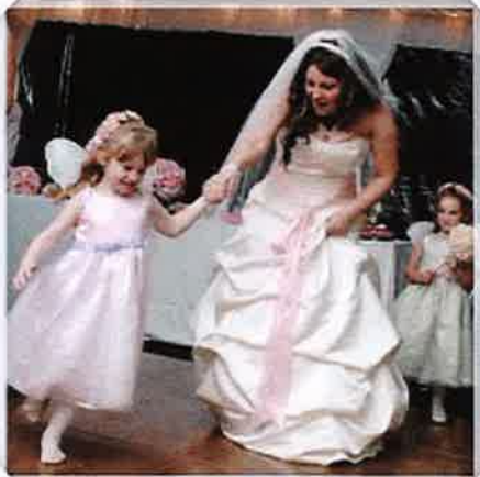
Dancing at our wedding with our cousin