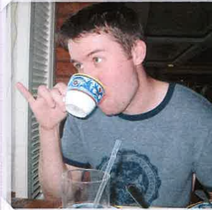
Playing "Tea Party" with our little cousins