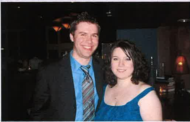
At our friends' wedding in Seattle this past summer