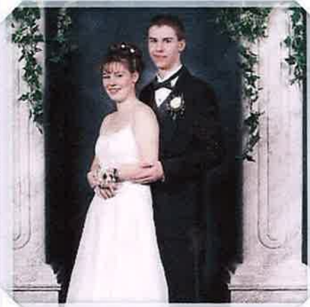
Junior Prom 10 yrs ago!