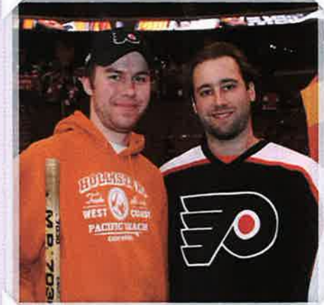
Meeting the Flyer's goalie!